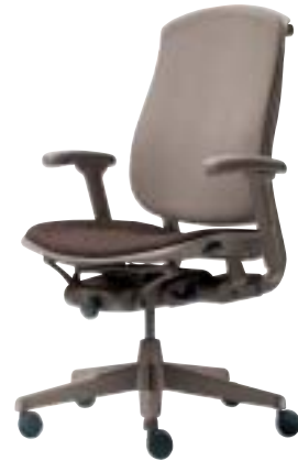
Celle Chair with Upholstered Seat and Back Option