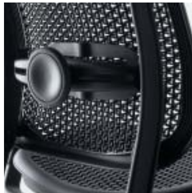
Cellular Suspension body support

Celle is uniquely suited to respond—to your shape, your motion, and the needs of your workplace. When you sit, its innovative Cellular Suspension™ provides immediate comfort and support. As you work, it flexes with your movements. Celle adjusts easily and rides fluidly for exceptional performance in a lower-cost work chair. Designed for application throughout a workplace, it complements interiors with thoughtful colors and a quiet look.