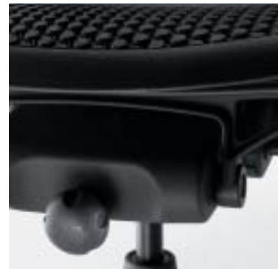
Smooth, balanced Harmonic tilt